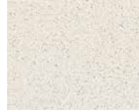
4875-20 Alabaster Mirage