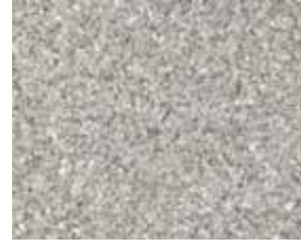
3540-90 Granic Vein